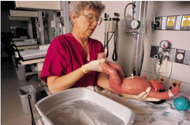
Complete innocence - the newborn

The ear begins to develop in only the fourth week of gestation. It starts with the inner ear, followed by the middle ear, and then by the outer ear. It is not until around 20 weeks that the organs associated with hearing are developed enough to transmit sound. The baby is able to hear and recognise its mother's sound just after 24 weeks' gestation. The loudest sounds in the uterus are the mother's heart beat, the sound of other organs (like the bowel gurgling), and the mother herself. A loud external noise will often 'startle' the baby, which is recognised by a kick felt by the mother, or excessive movements. The mother's voice is often seen to have a calming effect on the baby. It has been observed time and again, that if the mother has recited or listened to the Holy Qur'an a lot during her pregnancy, the child recognises this and quiets down to listen whenever someone recites the Holy Quran after birth.